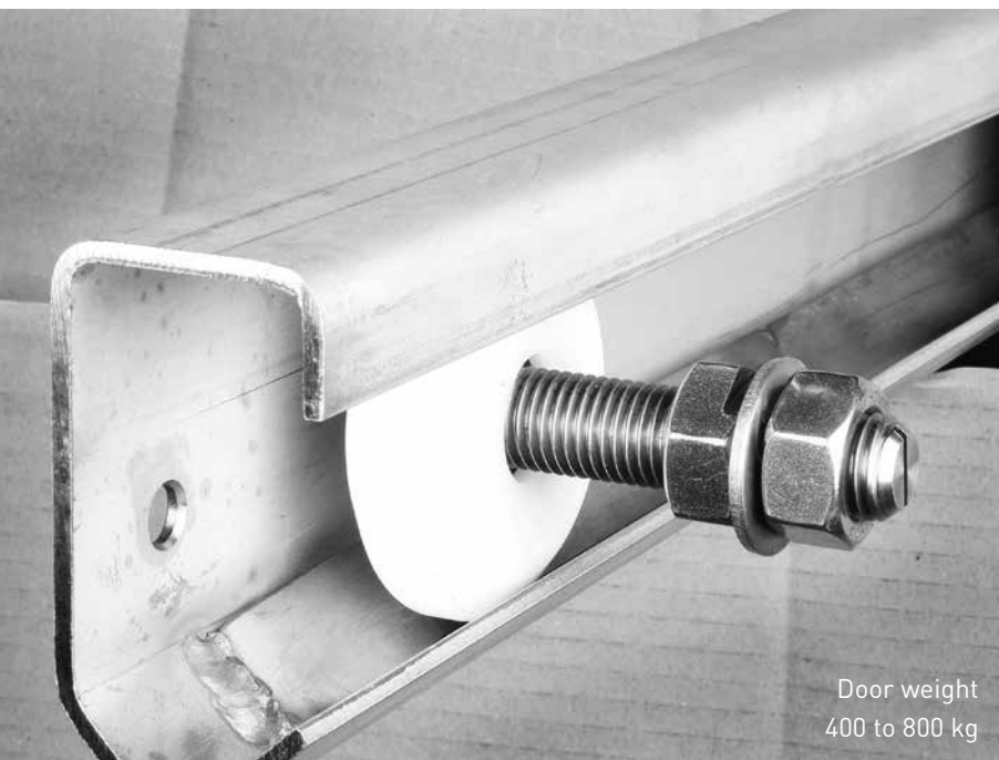
Door weight 400 to 800 kg